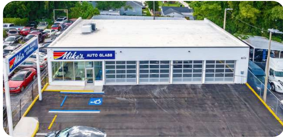
8512 N Florida Avenue, Tampa, FL 33604