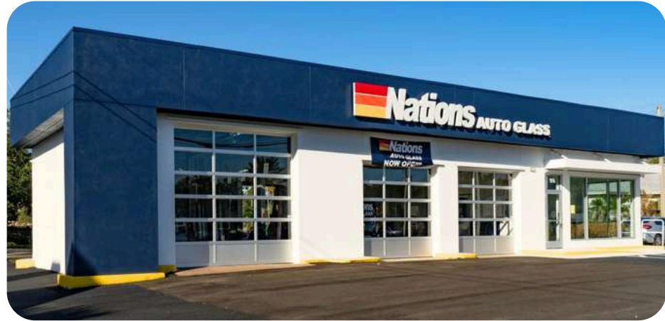
1816 S Harbor City Blvd, Melbourne, FL 32901