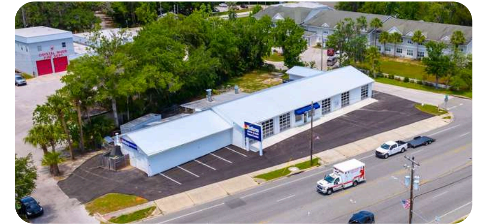
309 NW US-19, Crystal River, FL 34428