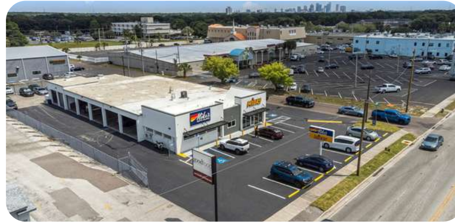
4901 N Armenia Avenue, Tampa, FL 33603