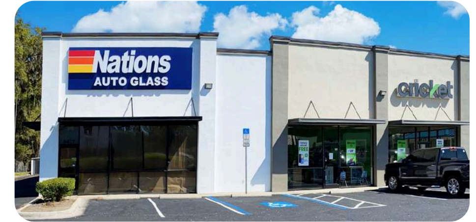
5421 N US Hwy 98, Lakeland, FL 33809