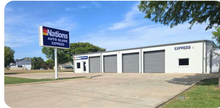
12190 Springfield Pike, Cincinnati, OH 45246