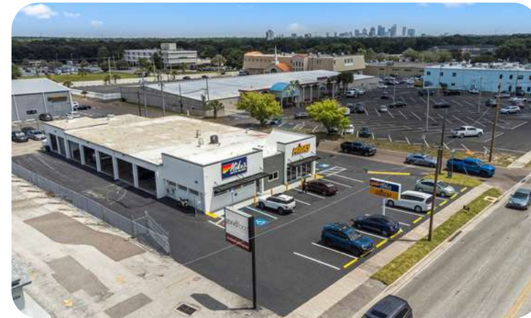
4901 N Armenia Avenue, Tampa, FL 33603