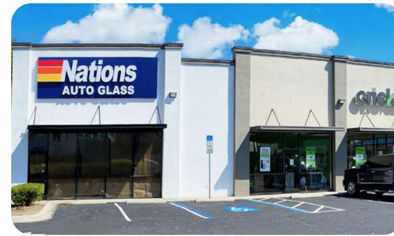
5421 N US Hwy 98, Lakeland, FL 33809