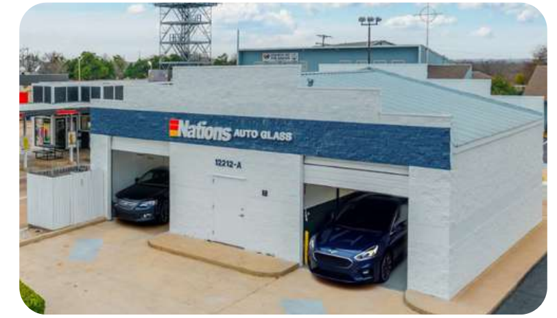
12212 Ranch Road 620 N, Austin, TX 78750