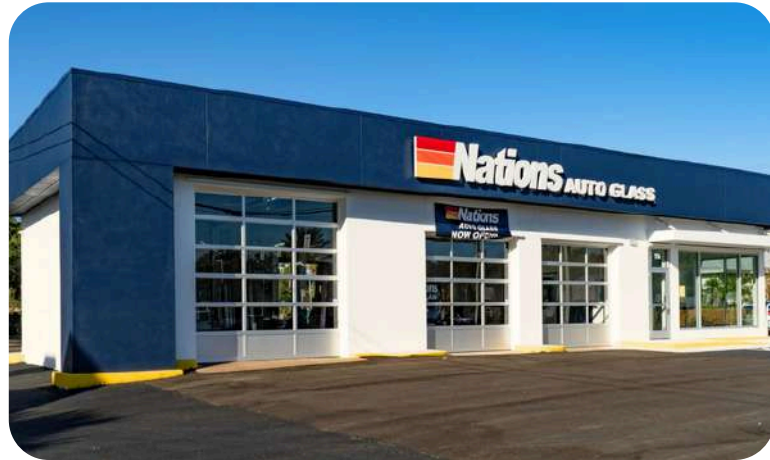
1816 S Harbor City Blvd, Melbourne, FL 32901