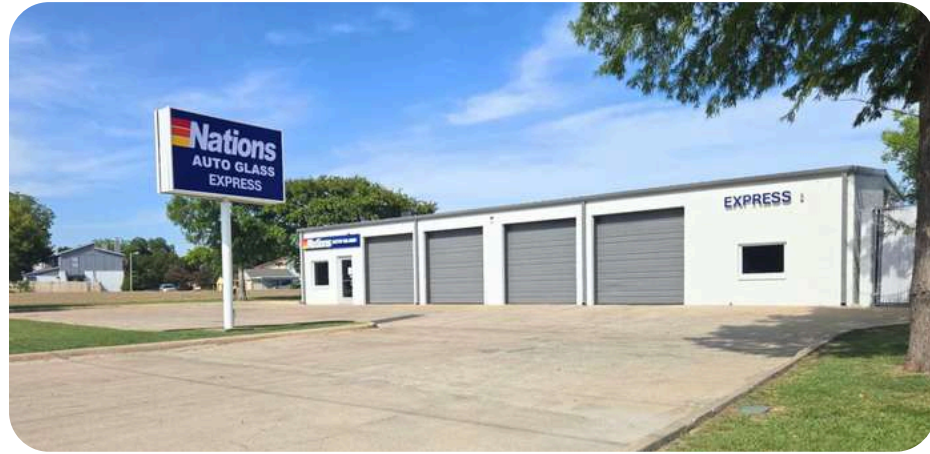
12190 Springfield Pike, Cincinnati, OH 45246